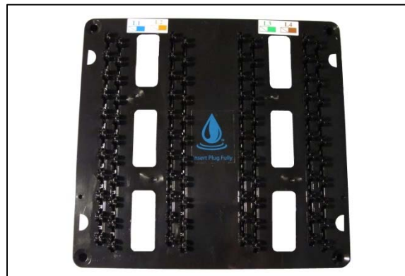
Wiring Center – GF9030